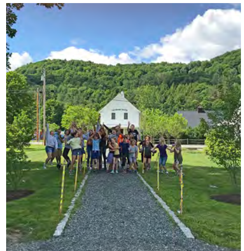
Summer Theatre Campers