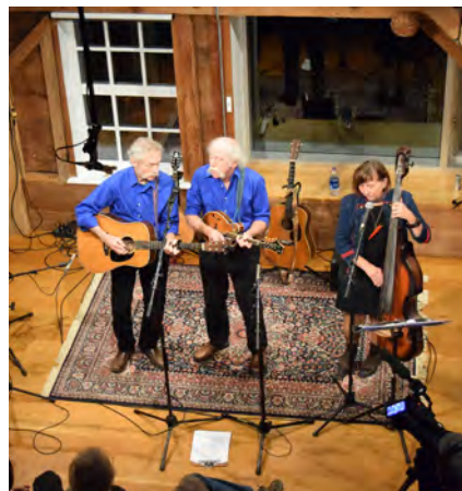
Concert in the Hayloft Performance Space