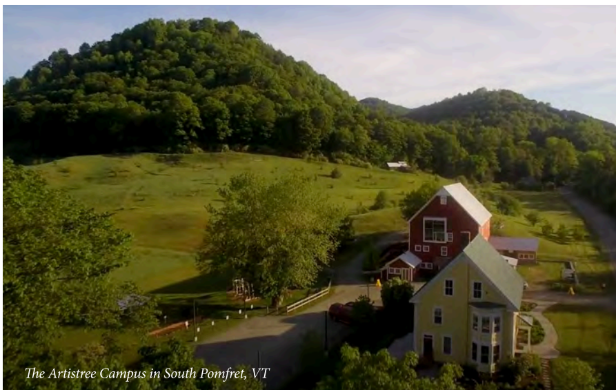
The Artistree Campus in South Pomfret, VT