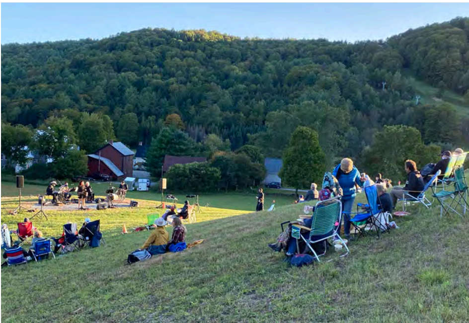
Artistree's Summer Concert Series on the hillside performance space