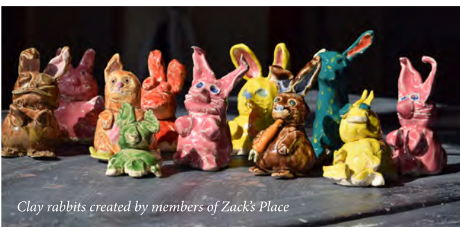
Clay rabbits created by members of Zack's Place