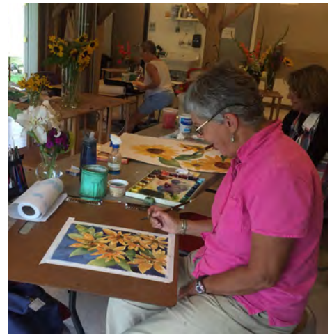
Watercolor painting class

OUR REACH: Over 3000 individuals from the Upper Valley and Central Vermont participate in Artistree classes, camps, exhibits, concerts, performances, and community outreach programs. Through us, families, retirees, working professionals, children, and teens pursue their creative dreams and engage in the artistic life of the community.