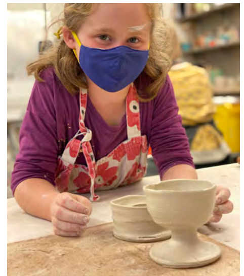
Clay afterschool class