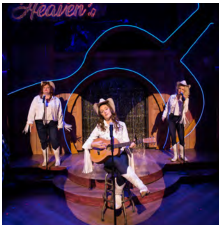
The Honky Tonk Angels Theatre Show