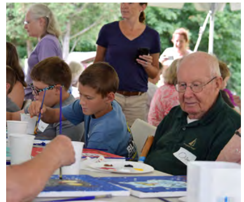
Generation to Generation outreach camp at the Thompson Center, Woodstock, VT