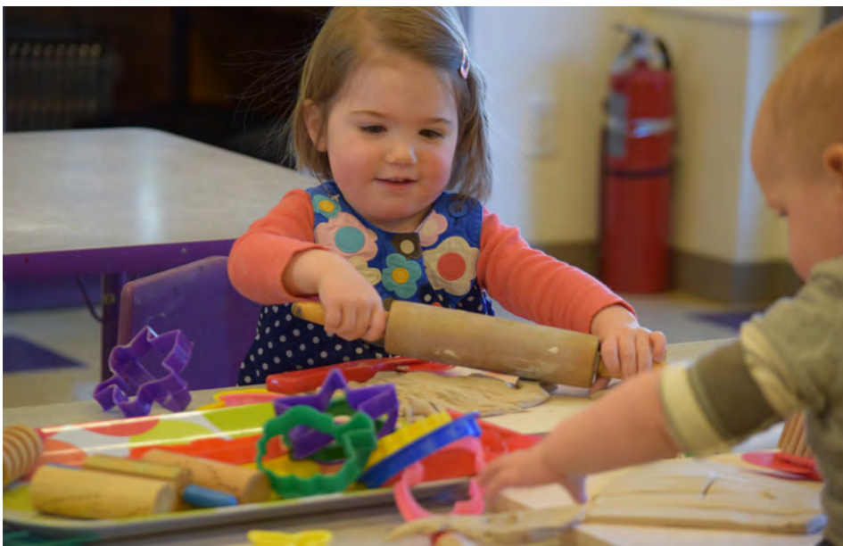
Young at Art Classes for Toddlers