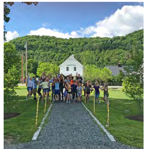
Summer Theatre Campers