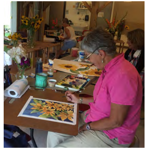
Watercolor painting class

OUR REACH: Over 3000 individuals from the Upper Valley and Central Vermont participate in Artistree classes, camps, exhibits, concerts, performances, and community outreach programs. Through us, families, retirees, working professionals, children, and teens pursue their creative dreams and engage in the artistic life of the community.