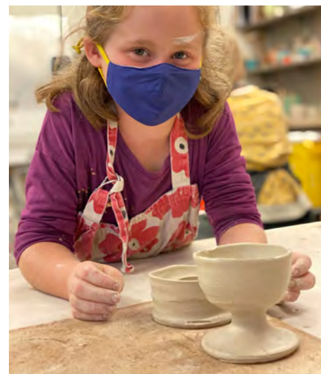
Clay afterschool class